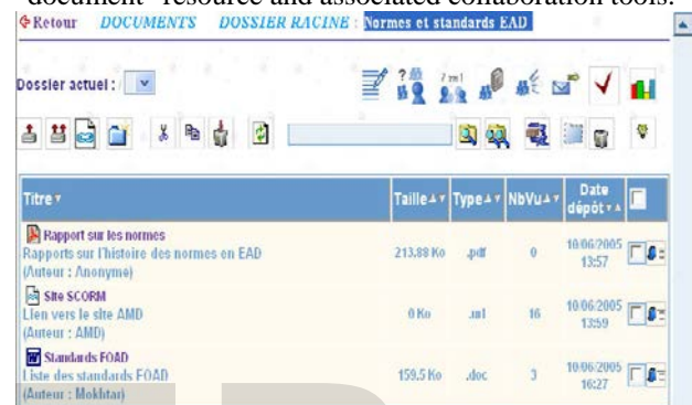
Figure 2: Document space associated with the resource (document) EAD Standards.

Resource space associated with the document: A resource space associated with the document is a resource space (space for interaction with resource) built around the "document" resource, made up of the "document" resource and associated collaboration tools.