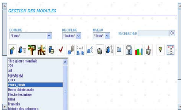
Figure 4: "Module space" associated with the resource (educational module) Test Course (Scorm).

Resource space associated with a pedagogical module: A module space is an (resource interaction space) a resource space built around the "Modulated" resource that can be attached to other interaction spaces such as a task, a project or group. Each module is associated with a module space giving access to different interaction tools: messaging, forum, comment editor, voting system, etc. This space can be associated with other types of resources such as media, articles, software, and so on. Each module resulting from the modification of another module is in particular in relation with the latter. Thus, in a module space one can follow the history of a module thanks to the relations that link it with its versions. A module space also gives access to all the prerequisite modules.